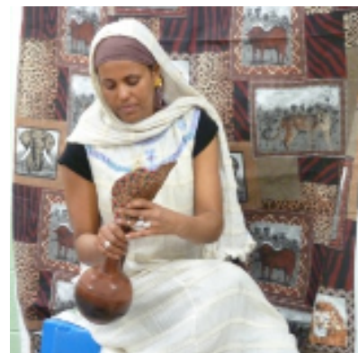
Family Day at Forest Hill was a celebration of African culture and the wider community. 752 people attended the day long event!